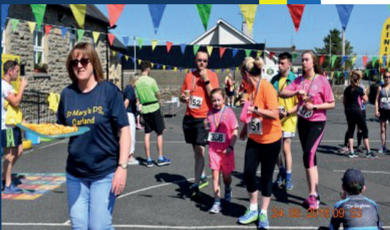
We promote a sense of community.