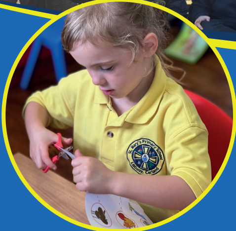
Foundation Stage - Primary 1 & 2