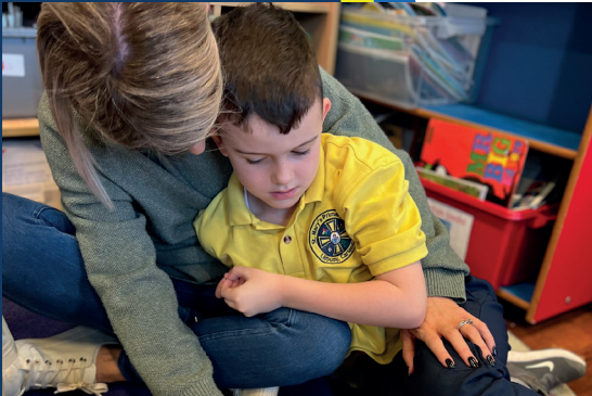
Children are the first priority of the school.