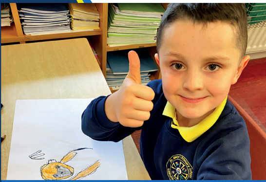
Our school... a safe, secure, happy, caring and stimulating environment.